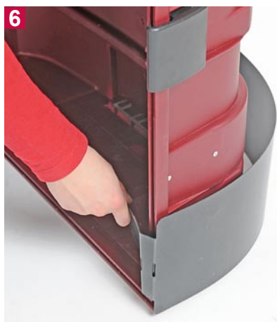
6 Attach the black kick-plate at the bottom of the desk.