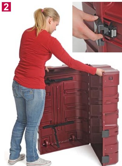
2 Release the latches to open the case – press in the gray inner portion and swing out the black clasp.