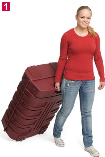
1 Expo Case has 2 wheels for easy transport.