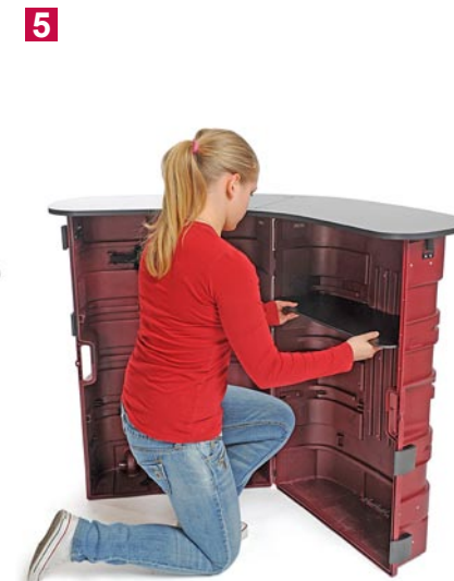
5 Attach the 4 inner shelves by inserting into the slots in the case.