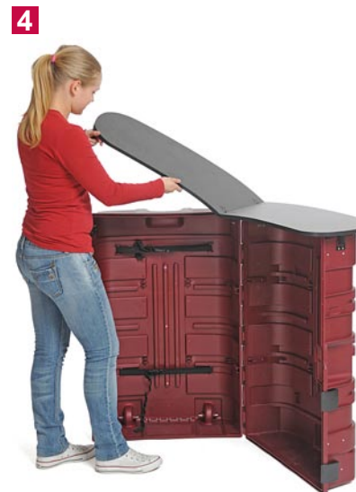
4 Unfold the counter top to the left side. Align and lock in place with the two latches, as in the previous step.