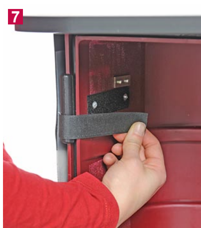
7 Wrap the graphic panel around the front side of the counter and connect it with the 4 velcro strips.