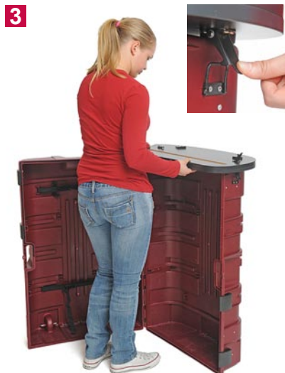
3 Mount the counter top on the right hand side of the case. Align the slot on the underside of the shelf and press/lock the two latches.